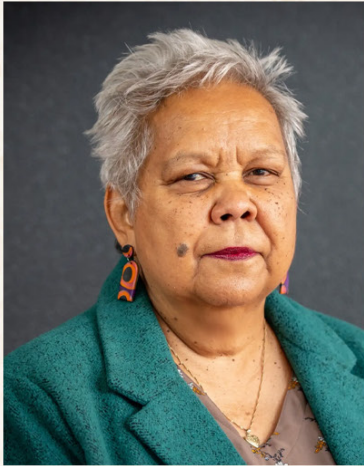
Dr Aunty Jackie Huggins