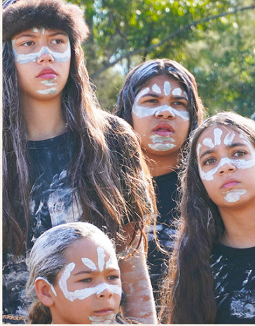
Bulwul Balaang Dancers