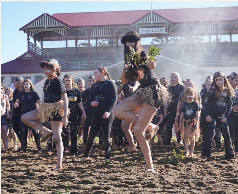
Bulwul Balaang Dance Group